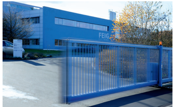
Perimeter Protection: Fast and safe access to industrial plants etc.

Suitable loop detectors and motion detectors are available from FEIG ELECTRONIC.