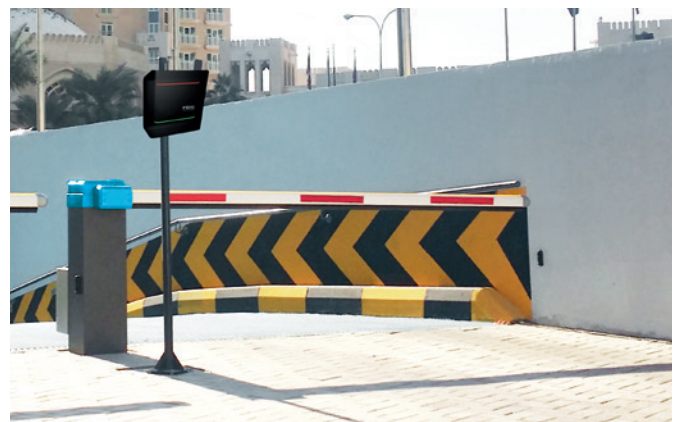
Parking Management: Comfortable access without waiting